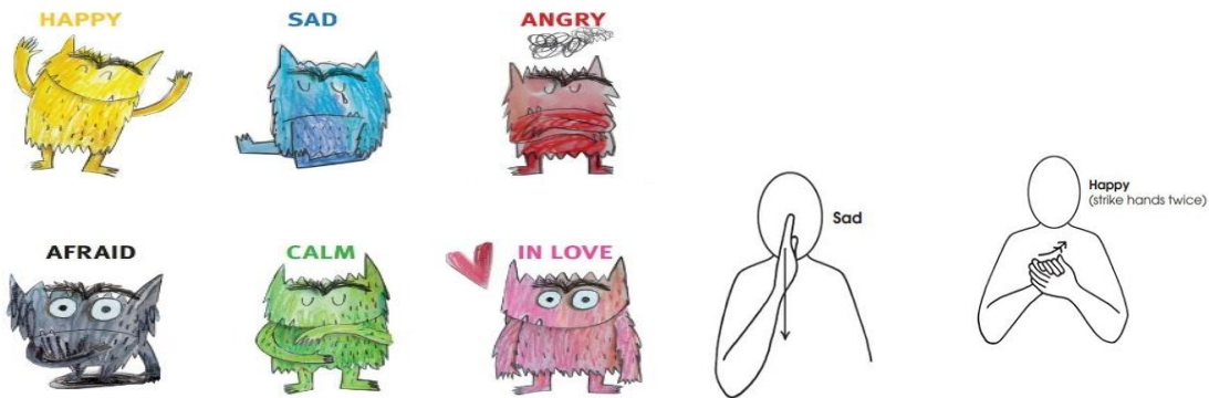
Makaton signs we are learning

The aim- to support children in becoming aware of how they are feeling and how their friends may be feeling.